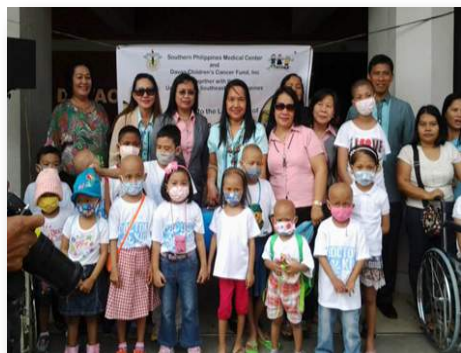
Students of the Hospital Bound Education with some faculty members of CED.