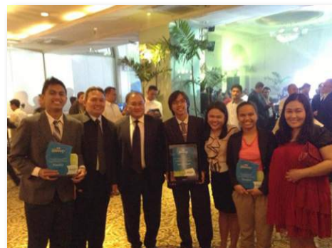
USEP Team with SMART Telecommunications CEO Manny V. Pangilinan

A team of four students from the Institute of Computing of the University of Southeastern Philippines clinched the Ideaspace Award and a Php 100,000 cash prize for presenting the best business plan among the ten national finalists to the ninth (9th) Smart Wireless Engineering Education