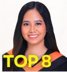
TOP 8 DACUP Quenniely B.

October 2024 Geodetic Engineers, Licensure Examination