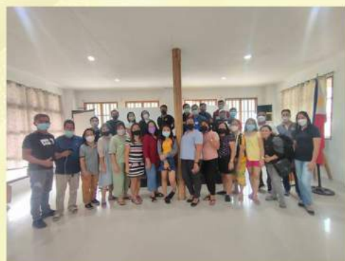
CARS faculty members during the Curricula Revision Workshop