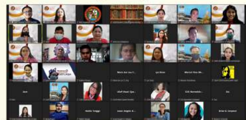
Some of the participants of the first session of USaPang RDE.

Further, USaPang RDE offered a platform for USEP community researchers, faculty members, non-teaching staff, and students to present their research and study that align with the University RDE agenda.