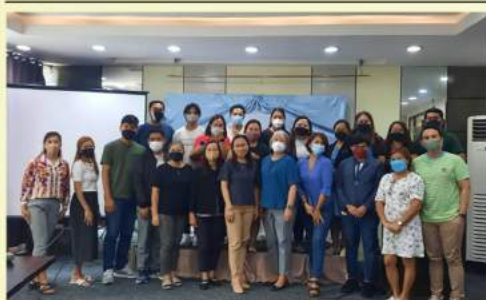
Executive members and the Technical Working Group (TWG) members of the USEP GAD Focal Point System

was revisited side-by-side with CMO no. 15, series of 2019 on the "Policies, Standards and Guidelines for Graduate Programs" for the revision of curricula of Graduate programs namely: Ph.D. in Horticulture, MS in Agriculture (MSA), MS in Engineering (MSE), MS in Forestry (MSF), MS in Environmental and Resource Management (MSERM), and Master of Extension Education (MEXEd); and CMO no. 23 series of 2021, also known as "Policies, Standards, and Guidelines for the Bachelor of Science in Agriculture program" for the undergraduate program- Bachelor of Science in Agriculture program with seven (7) major fields (Agronomy, Animal Science, Enterprise Management, Entomology, Horticulture, Plant Pathology, and Soil Science).