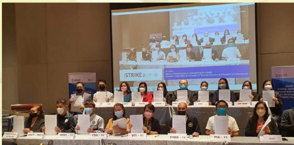
CHEERS TO MORE INDUSTRY-ACADEME COLLABORATIONS. USEP joins other State Universities and Colleges (SUCs) and Higher Education Institutions (HEIs) in Region XI in the signing of MoU formalizing the partnership with various government agencies for ISTRIKE Davao RIIC.

At present, CIC offers three (3) undergraduate programs, namely: Bachelor of Science in Information Technology (BSIT) with specializations in Business Technology Management and Information Security; Bachelor of Science in Computer Science (BSCS) with specialization in Data Science; and Bachelor of Library and Information Science (BLIS), and three (3) graduate programs: Master in Information Technology (MIT); Master of Science in Library and Information Science (MLIS); and Doctor in Information Technology (DIT).