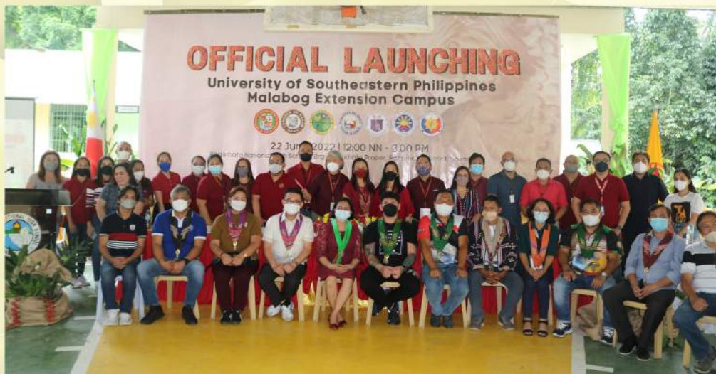
USEP'S VISION TO TRANSFORM COMMUNITIES IN GIDAS. Officials and members of the University Board of Regents, together with the honored guest in the launching of MEC pose for a photo opportunity.