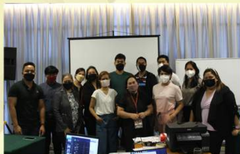
Public Affairs Division (PAD) personnel and College Coordinators