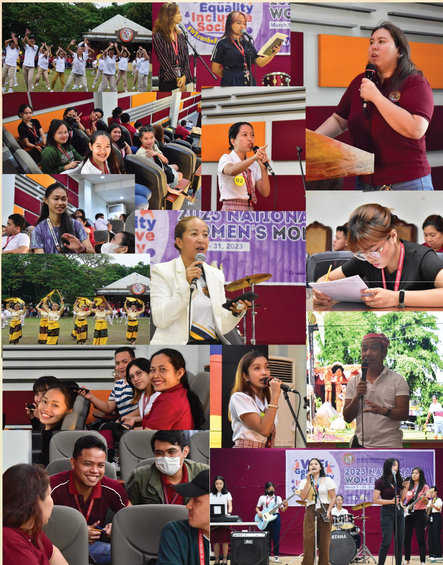
A SEASON TO CELEBRATE AND APPRECIATE WOMEN AND THE ARTS. With the combined efforts of the Office of Student Affairs and Services- Cultural Affairs Unit and the Gender and Development Office, the University blooms to be a melting pot of beauty and talent; an epitome of a community that values women, and a force that echoes cultural and societal transformation.