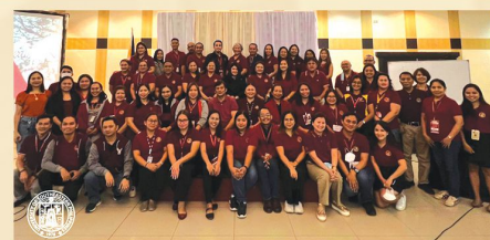
Participants of the PQA Orientation

This effort of the University ensures that the FY 2024 budget proposal is consistent with the priorities and policy directions of the current administration as embodied in the 8-point Socioeconomic Agenda and the Philippine Development Plan (PDP) 2023-2028; priority programs and projects outlined in the FY 2023-2028 Public Investment Program (PIP), FY 2024-2026 Three-Year Rolling Infrastructure Program (TRIP); Regional Development Council XI priority Programs, Activities, and Projects (PAPs); UseP Strategic Plan 2022-2027; UseP Institutional Development Plan 2022-2024; UseP 6-point priority agenda; Land Use Development and Infrastructure Plan (LUDIP) 2022-2031; and Program accreditation, assessment, and certification requirements.