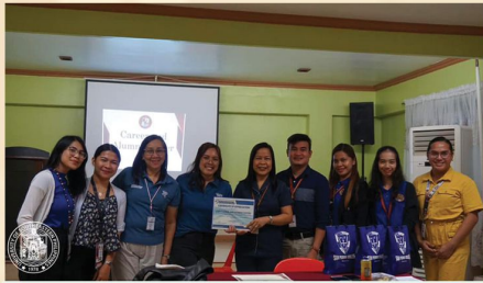
San Pedro College Alumni Office

and extension, several higher education institutions (HEIs) in Region XI and beyond had conducted benchmarking visits on the University of Southeastern Philippines (USEP) for the first quarter of 2023.