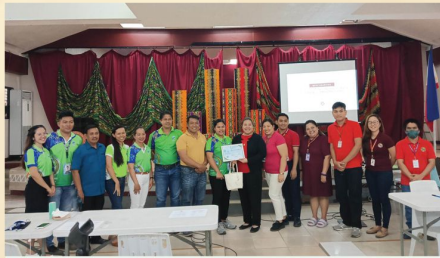
Samal Island City College (SICC)

The benchmarking activity allowed the San Pedro College Alumni Office to observe the operations of the Career and Alumni Center, which provides various career development services to its alumni.