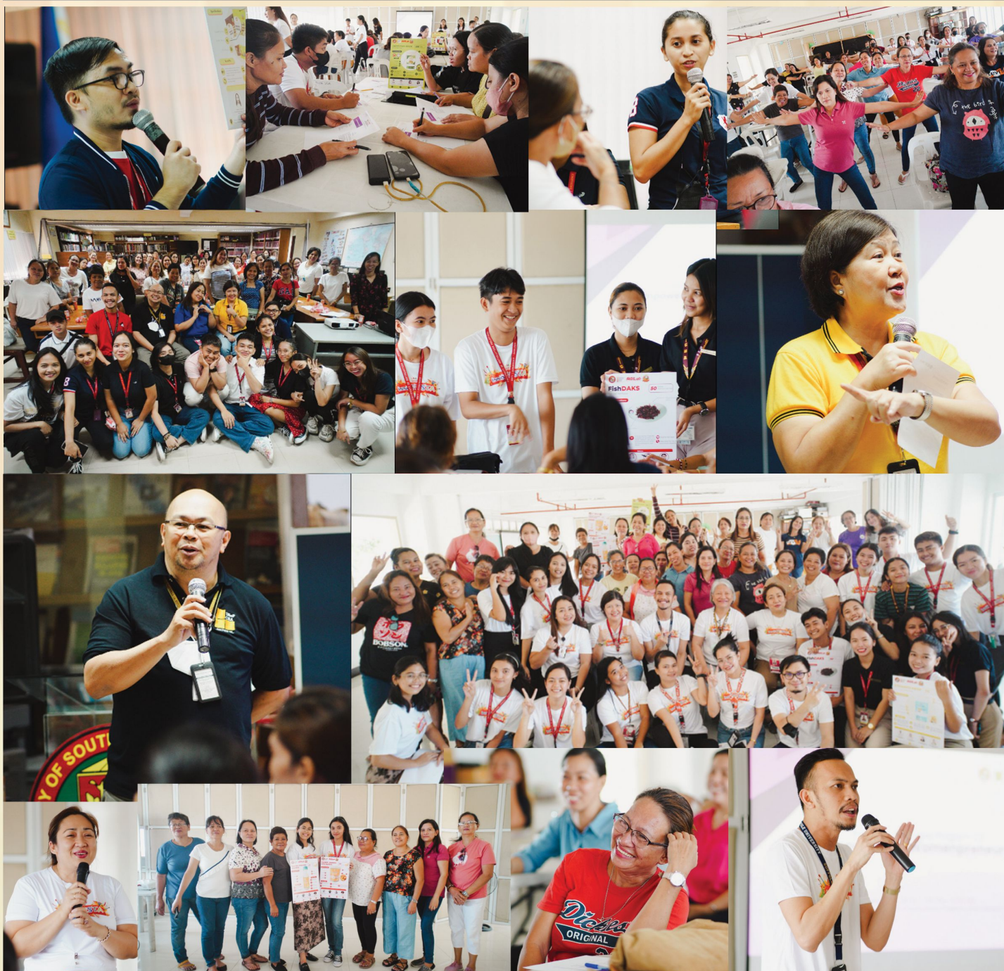
TRANSFORMING LIVES OF WOMEN, TRANSFORMING COMMUNITIES. Womenpreneurs from Brgy. Centro (San Juan) Agdao participate in the transforming programs initiated by the University through CBA, KTTD, AGILab TBI.