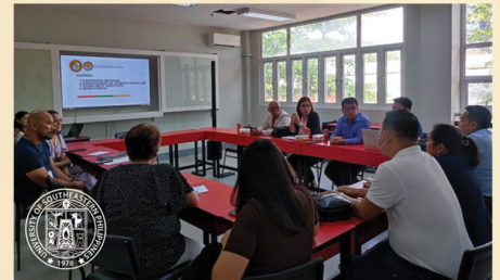
North Eastern Mindanao State University

By conducting the visit, SICC has gained insight into the best practices implemented by the USEP-GAD office in the areas of policy, governance, instruction, research, and extension.