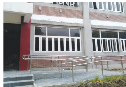
The new IT Building with its PWD ramp near the main entrance.

In USeP, creating a barrier-free environment for the disabled in the main campus in Obrero, as well as its external campuses, has been given great importance. The Physical Development Division (PDD) has adopt-