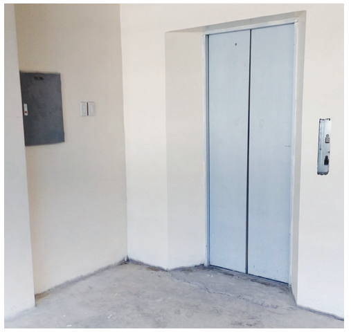
Installation of an elevator at the Industrial Electronics & Mechatronics Training Center.

Despite the headway that have been attained, much has still to be done. Not only buildings must be made barrier-free but also outdoor facilities, like sidewalks, parking areas and student kiosks, must be accessible as well. We are on the right track though. Slowly we will eventually transform our campuses to be totally PWD-friendly in the years to come.