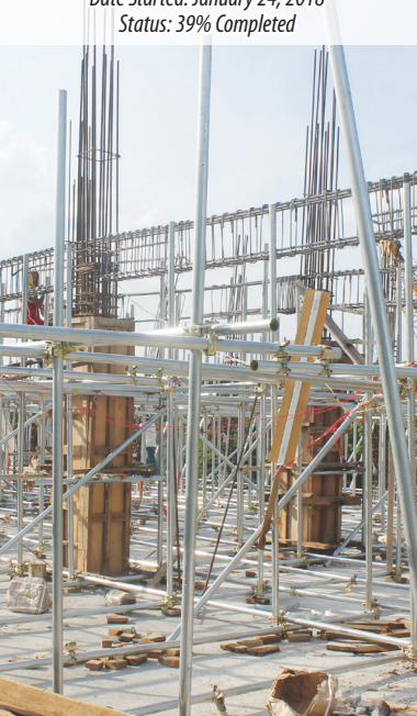
Project: Construction of 5-storey College of Governance and Business Building - Phase 1B Date Started: January 24, 2018 Status: 39% Completed