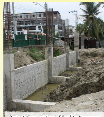
Project: Construction of Quality Assurance, Accreditation, TLE Building - Phase I Date Started: December 27, 2016 Status: 49% Completed