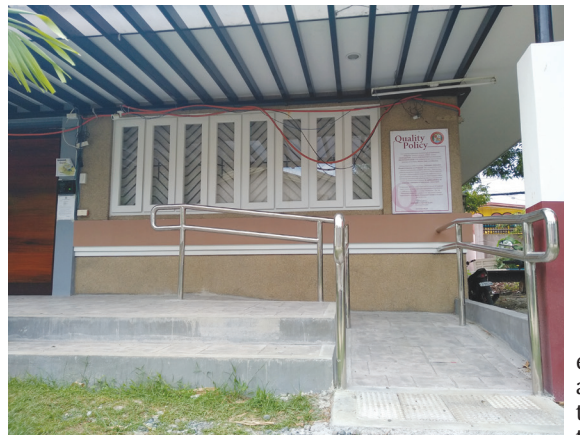
An accessible ramp added to the Trade and Crafts Building

ccording to the 2010 census of Philippine the Statistics Authority, 16 out of 1,000 Filipinos or 1.57% of the population suffer some forms of disability. These persons with disabilities (PWDs) often struggle to gain access to private and public facilities, including educational institutions.