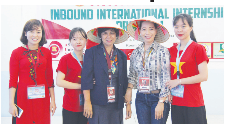
Delegates from Tan Trao University with the faculty members from the USeP College of Educatio

eacher Education Students from Tan Trao University (TTrU) in Vietnam bid farewell to the University of Southeastern Philippines (USeP) during the culmination of their In-bound International Practice Teaching on March 23,