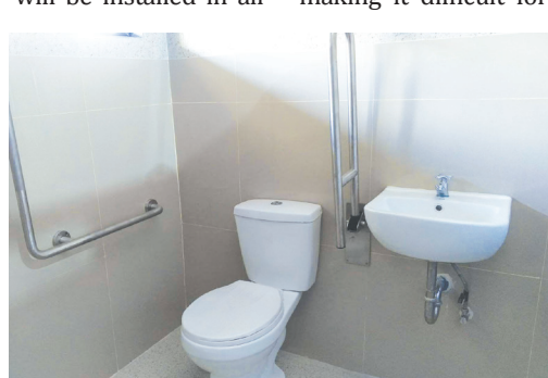
The newly-repaired comfort room at the Social Hall with grab bars for PWDs.

At present, not all existing buildings have ramps adjacent to main entrances making it difficult for