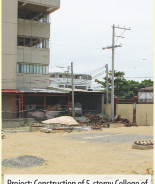
Project: Construction of 5-storey College of Engineering Laboratory Building - Phase I Date Started: December 17, 2016 Status: 39% Completed