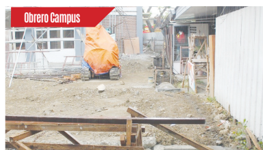
Project: Construction of 5-Storey Information Technology (IT) Building - Phase IV Date Started: July 29, 2018 Status: 72% Completed