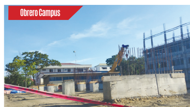
Project: Construction of 7-Storey Multi-Media Learning Resource Center Date Started: December 25, 2017 Status: 72.04% Completed