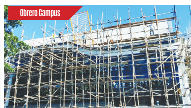
Project: Construction of College of Arts and Sciences (CAS) Building Façade Date Started: March 11, 2018 Status: 86.50% Completed