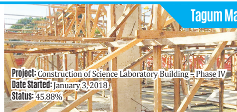
Project: Construction of Science Laboratory Building - Phase IV Date Started: January 3, 2018 Status: 45.88%