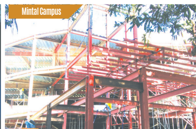
Project: Construction of a Three-Storey Building to Replace the Old Building in Mintal Campus - Phase I Date Started: January 3, 2018 Status: 45.88% Completed