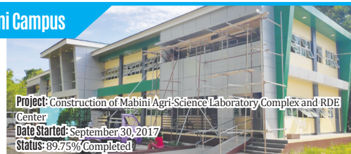
Project: Construction of Mabini Agri-Science Laboratory Complex and RDE Center Date Started: September 30, 2017 Status: 89.75% Completed