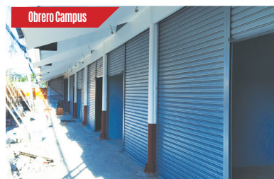
Project: Renovation of Commercial Stalls (Plumbing System) Date Started: November 17, 2018 Status: 80.32% Completed