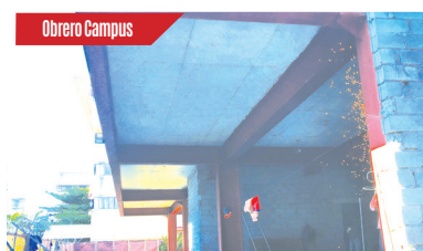
Project: Construction of 5-Storey College of Engineering Laboratory Bldg. - Phase I Date Started: December 17, 2016 Status: 100% Completed