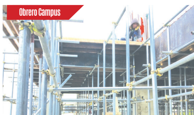
Project: Construction of Quality Assurance, Accreditation, TLE Bldg. - Phase IB Date Started: May 28, 2018 Status: 70% Completed