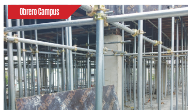
Project: Construction of Quality Assurance, Accreditation, TLE Bldg. - Phase I Date Started: December 27, 2016 Status: 82% Completed