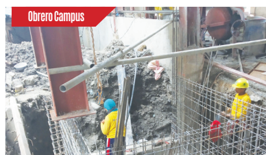
Project: Establishment of 5-Storey Science Laboratory Building Date Started: May 8, 2017 Status: 73% Completed