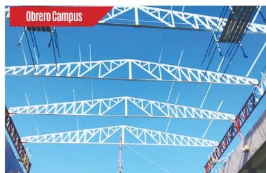
Project: Proposed Roofing of College of Education - Phase I Date Started: November 3, 2018 Status: 39.79% Completed