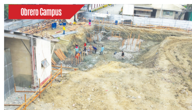
Project: Construction of Admin Building - Phase I Date Started: October 29, 2018 Status: 7% Completed